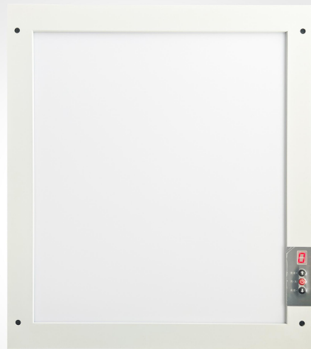
HF-GA-C1 LED medical viewing light